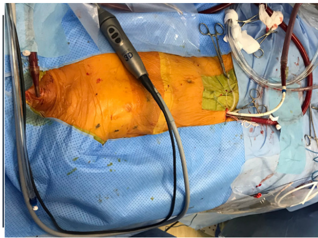
Figure 1: Peripheral cardiopulmonary bypass

We used systemic doses of heparin 3ml/ kg body weight. We opened a mini incision on the right inguinal fold, revealing common femoral artery and femoral vein (for the inferior vena cava- IVC) . SVC was placed through the right IJV with Seldinger technique. We tested the arterial line and the CPB was activated.