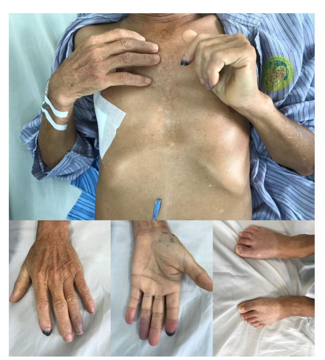
Figure 1: Patient's image post operation; Patient left hand present with Raynaud's phenomenal and II, IV-digit necrosis.