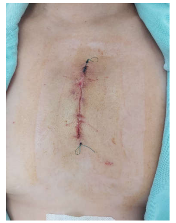
Figure 3. Ministernotomy incision