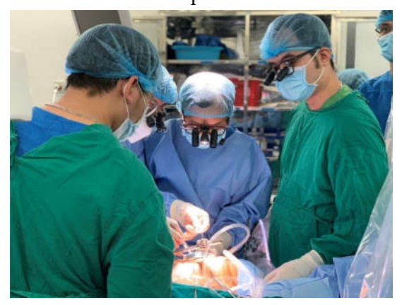
Figure 4. Surgeon from Cho Ray hospital helped Dong Nai's team performing minimally invasive mitral surgery

Early postoperative complications are displayed in Table 3.